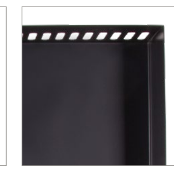
Suitable for portrait mounting

Vented top and bottom panels allow airflow to and from the device