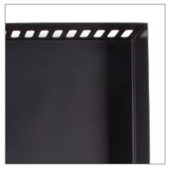
Vented top and bottom panels allow airflow to and from the device