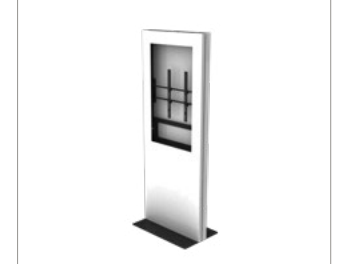
Ultra-slim single screen digital signage desk