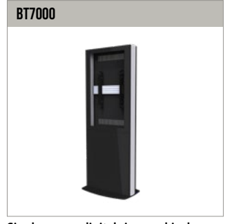
Single screen digital signage kiosk