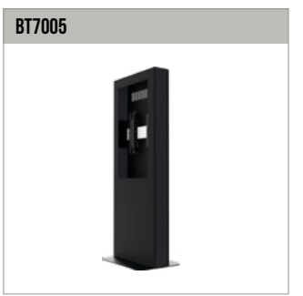
Single screen digital signage kiosk