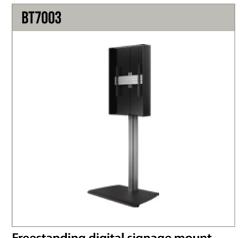
Freestanding digital signage mount with screen enclosure