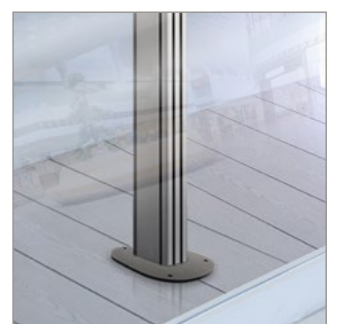
High-end aesthetic quality