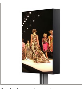
Suitable for portrait mounting