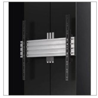
Simple 'hook-on' screen installation