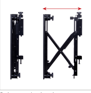
Push to open / push to close system provides quick and easy service access