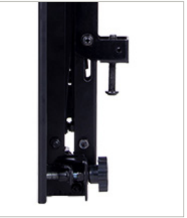
Safety screws help prevent unauthorised removal of screens