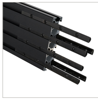
Multiple rail lengths available (rails can also be joined to create larger installs)