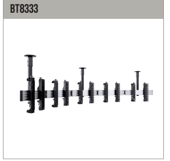
Curved Universal Ceiling Mounted Menu Board Mounting System for portrait or landscape mounting