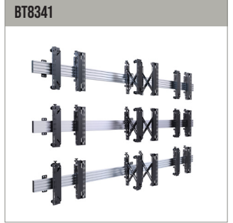
Universal Pop-Out Videowall Mounting System for video wall configurations