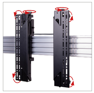
Tool-less micro-adjustment for seamless display alignment