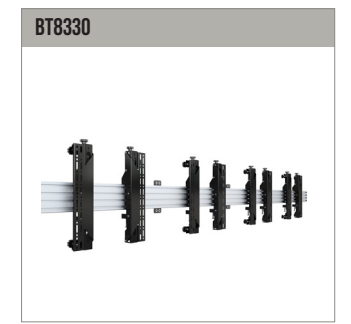
Universal Menu Board Mounting System Universal Ceiling Mounted Menu Board for wall mounted menu board configurations System for menu board configurations