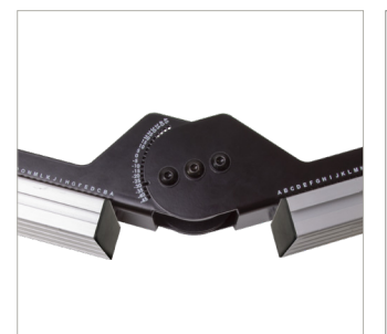
Angle up to +/-45° to create a concave or convex curved menu board