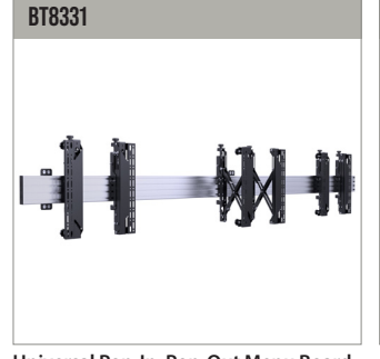
for wall mounted menu board configurations System for menu board configurations