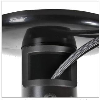
Integrated cable management to hide unsightly cables