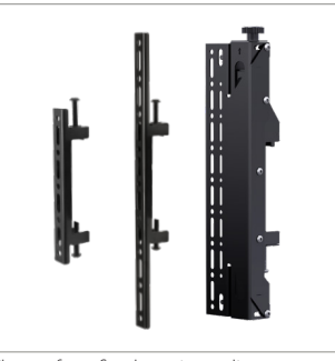
Choose from fixed or micro-adjustment