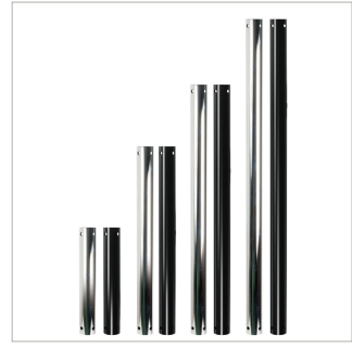
Ø50mm poles are available in lengths ranging from 0.5m - 3m to provide the desired drop