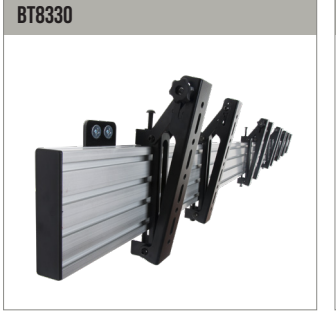
Universal Menu Board Mounting System Universal Pop-In, Pop-Out Menu Board