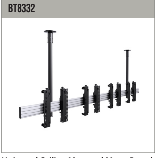
Universal Ceiling Mounted Menu Board Mounting System configurable to suit