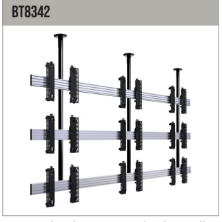
Universal Ceiling Mounted Video Wall System for video wall configurations