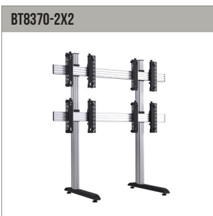
BT8370-2X2 Universal Videowall Stand for 2x2 Videowalls