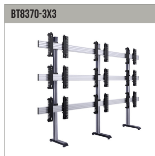
BT8370-3X3 Universal Videowall Stand for 3x3 Videowalls