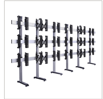
Use the online configurator to customise screen set-up