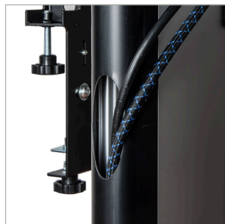
Cable management covers hide untidy cables and add to the stylish finish