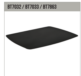
BT7032 / BT7033 / BT7863 AV Accessory Shelves can be attached directly to a vertical column