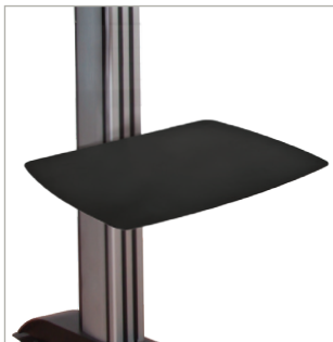
Fit System 2 compatible accessories such as shelves without using collars