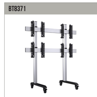
BT8371 Universal Mobile Videowall Stand for Videowalls