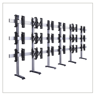
Use the online configurator to customise screen set-up

Please note BT8371-3X3 is available in two packages: BT8371-3X3 is designed for screens from 46"-55" and