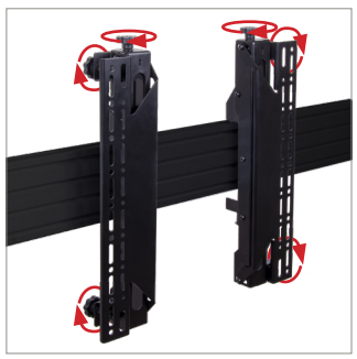
Tool-less micro-adjustment for seamless display alignment