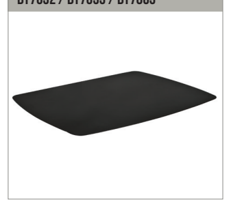
Large AV Accessory Shelf can be attached directly to a vertical column