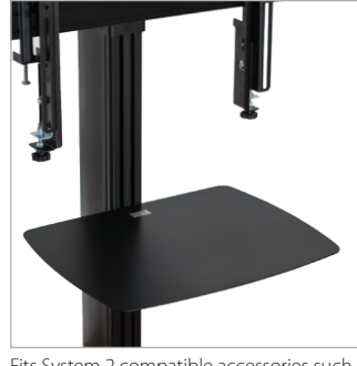
Fits System 2 compatible accessories such as shelves without using collars