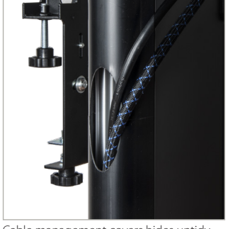
Cable management covers hides untidy cables and adds to the stylish finish