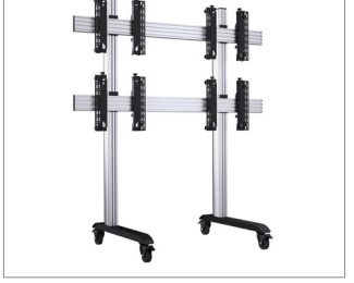
Universal Mobile Videowall Stand For 2x2 Videowalls