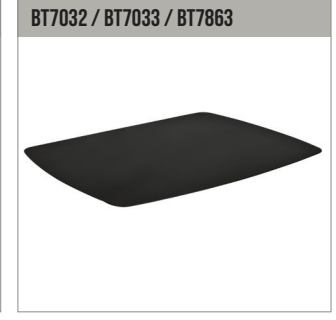
\textbf{AV Accessory Shelves} \ \mathsf{can} \ \mathsf{be} \ \mathsf{attached} directly to a vertical column