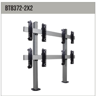
Universal Bolt Down Videowall Stand for 2x2 Videowalls