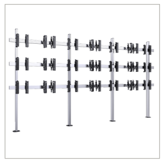
Use the online configurator to customise

*Please note BT8372-3X3 is available in two packages: BT8372-3X3 is designed for screens from 46"-55" and ned for screens from 55"-60". BT8372-3X3-60 has a width of 3505mm