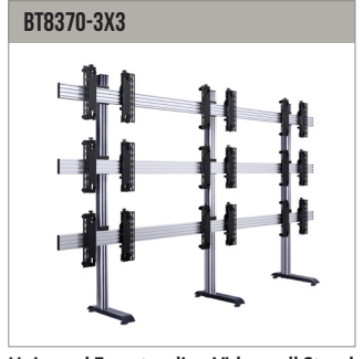
Universal Freestanding Videowall Stand