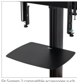
Fit System 2 compatible accessories such as shelves without using collars