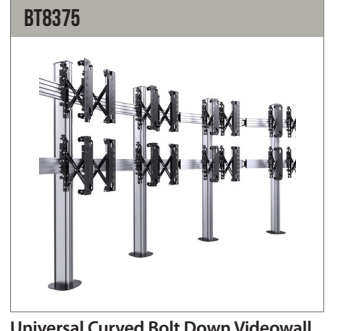
Universal Curved Bolt Down Videowall Stand for screens up to 75"