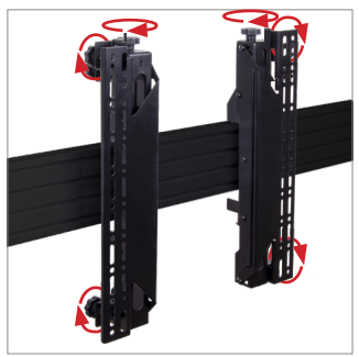
Tool-less micro-adjustment for seamless screen alignment