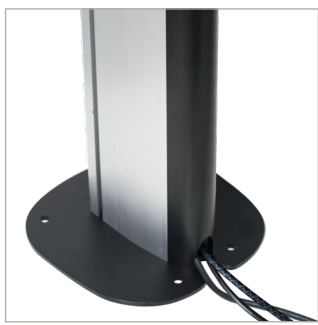
Small footprint base is ideal for shop windows and cable management covers hide untidy cables for a neat install