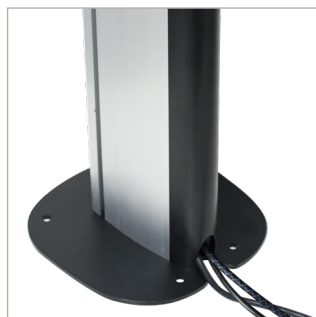
Small footprint base is ideal for shop windows and cable management covers hide untidy cables for a neat install