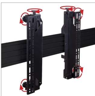
Tool-less micro-adjustment for seamless display alignment