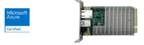
* Slightly larger than a credit card