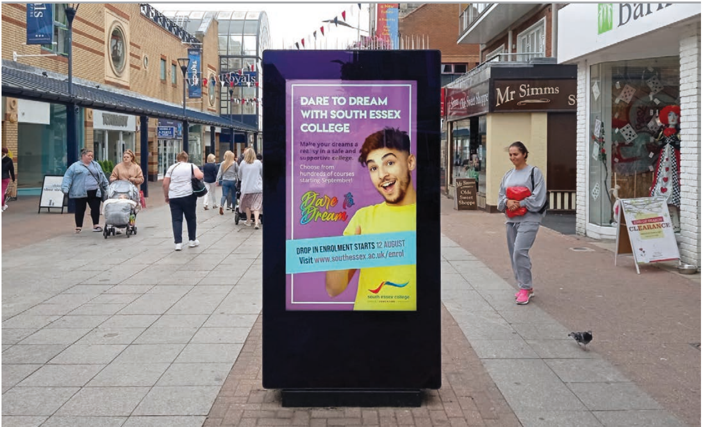
Stunning outdoor totems; perfect for any weather conditions